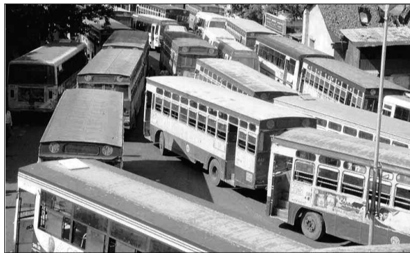
AMC has given advertisement in newspapers to privatise services of 592 buses of AMTS.