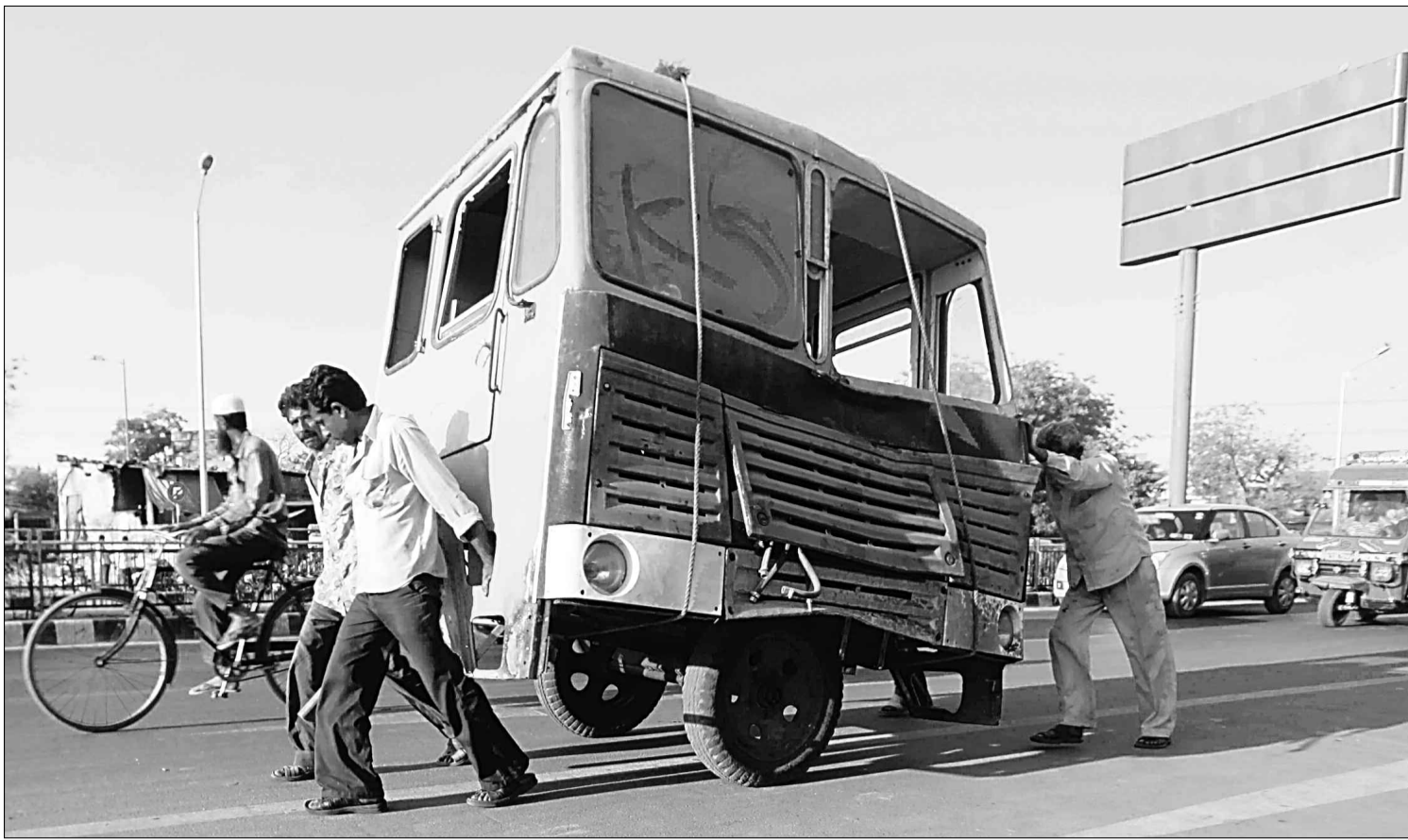
Workers carry the cabin of a dismantled truck on a handcart in Ahmedabad on Monday.