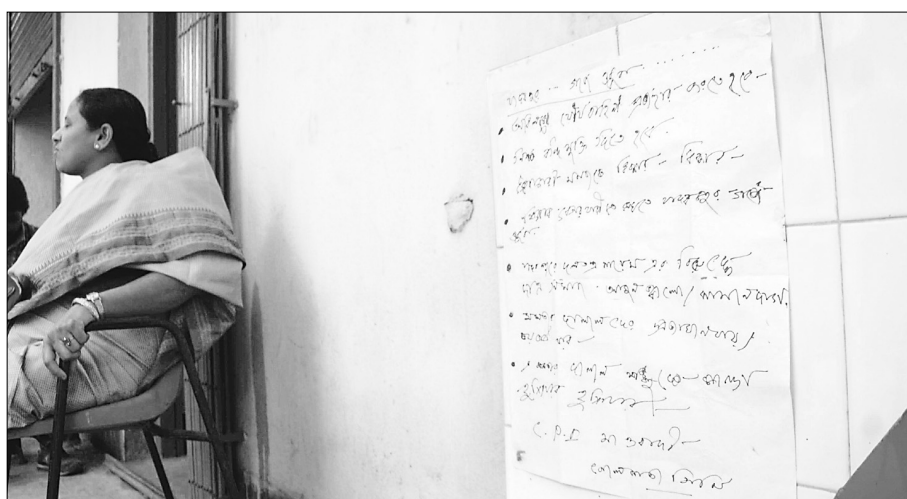
A POSTER undersigned by CPI-Maoist, City Committee, was found pasted inside Jadavpur University campus on Friday.

Trinamool sources said, the body of the victim is being brought to Kolkata and will be kept at Trinamool Bhavan.