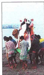
Immersion of a Jagadgauri idol under way on Saturday